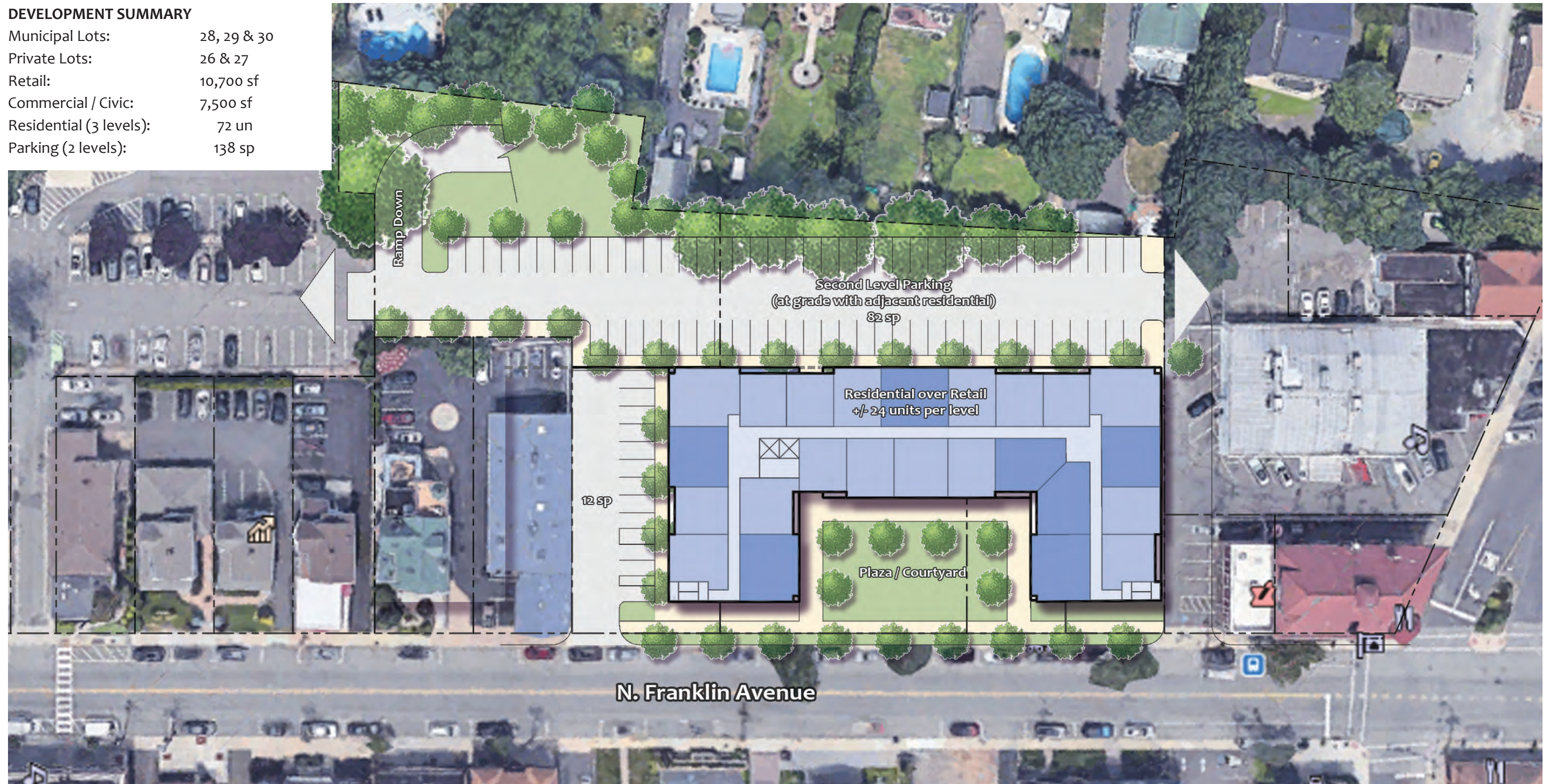
Residential Levels Typ. (3 levels)