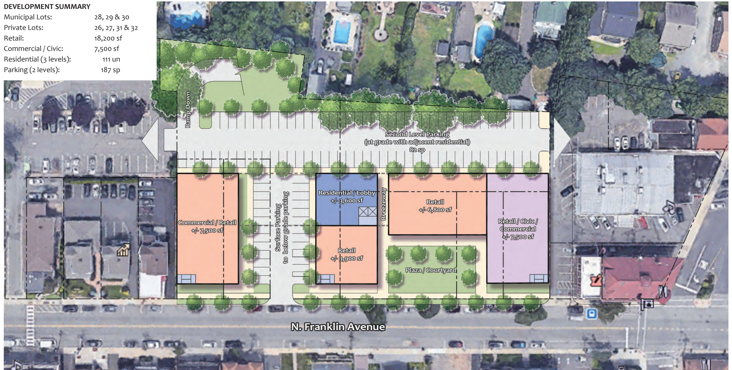
Franklin Avenue Retail Level with Second Level Parking at grade with rear properties