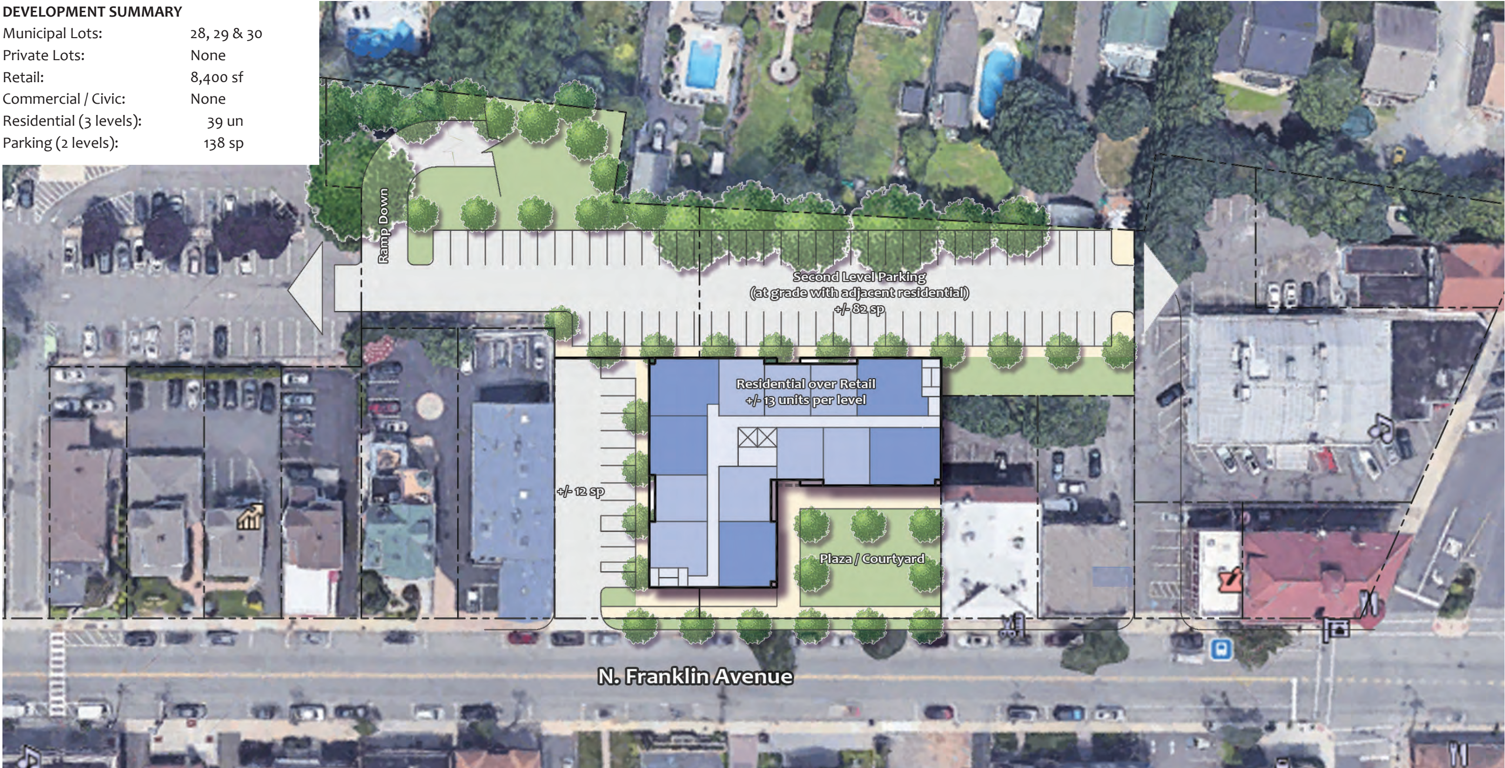
Residential Levels Typ. (3 levels)