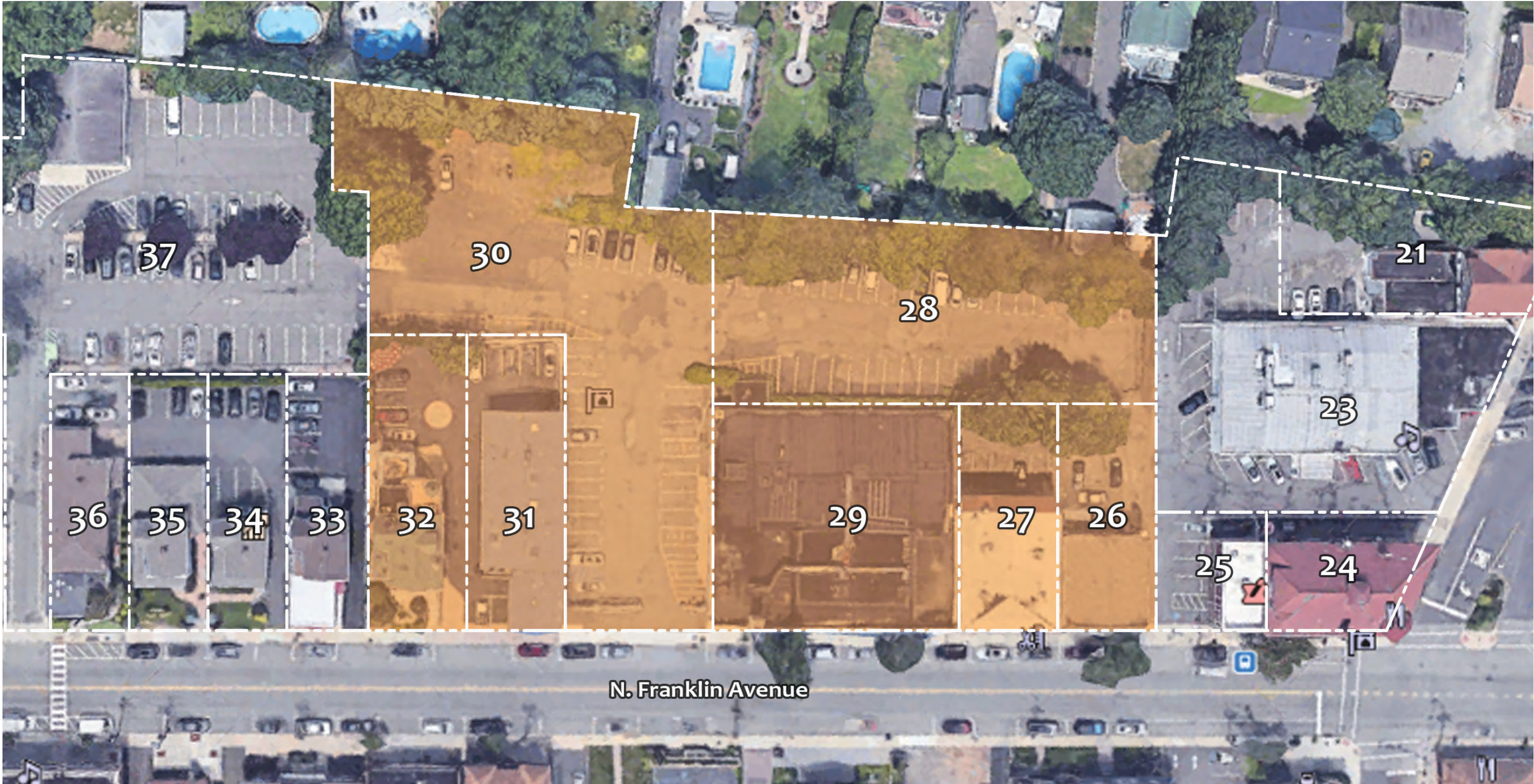
RFEI Targeting Properties Area