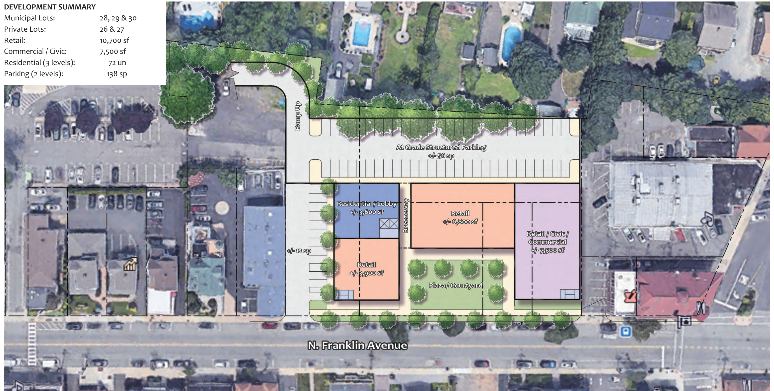
Franklin Avenue Retail Level with At Grade Parking