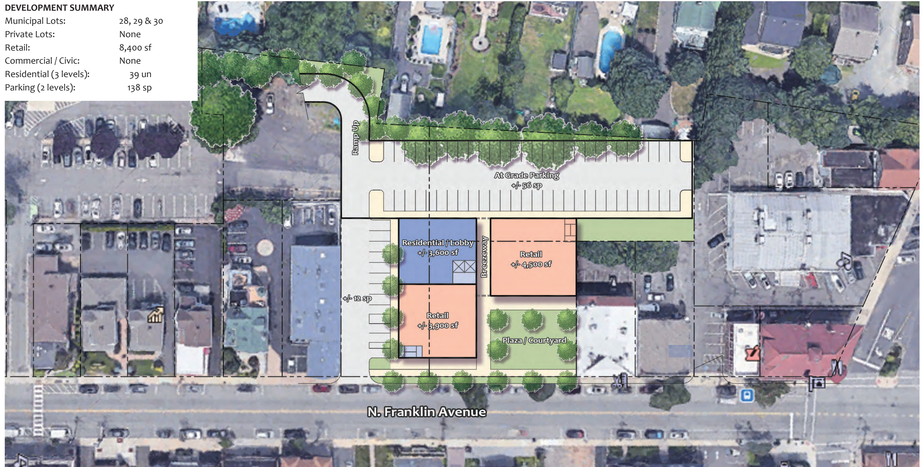
Franklin Avenue Retail Level with At Grade Parking