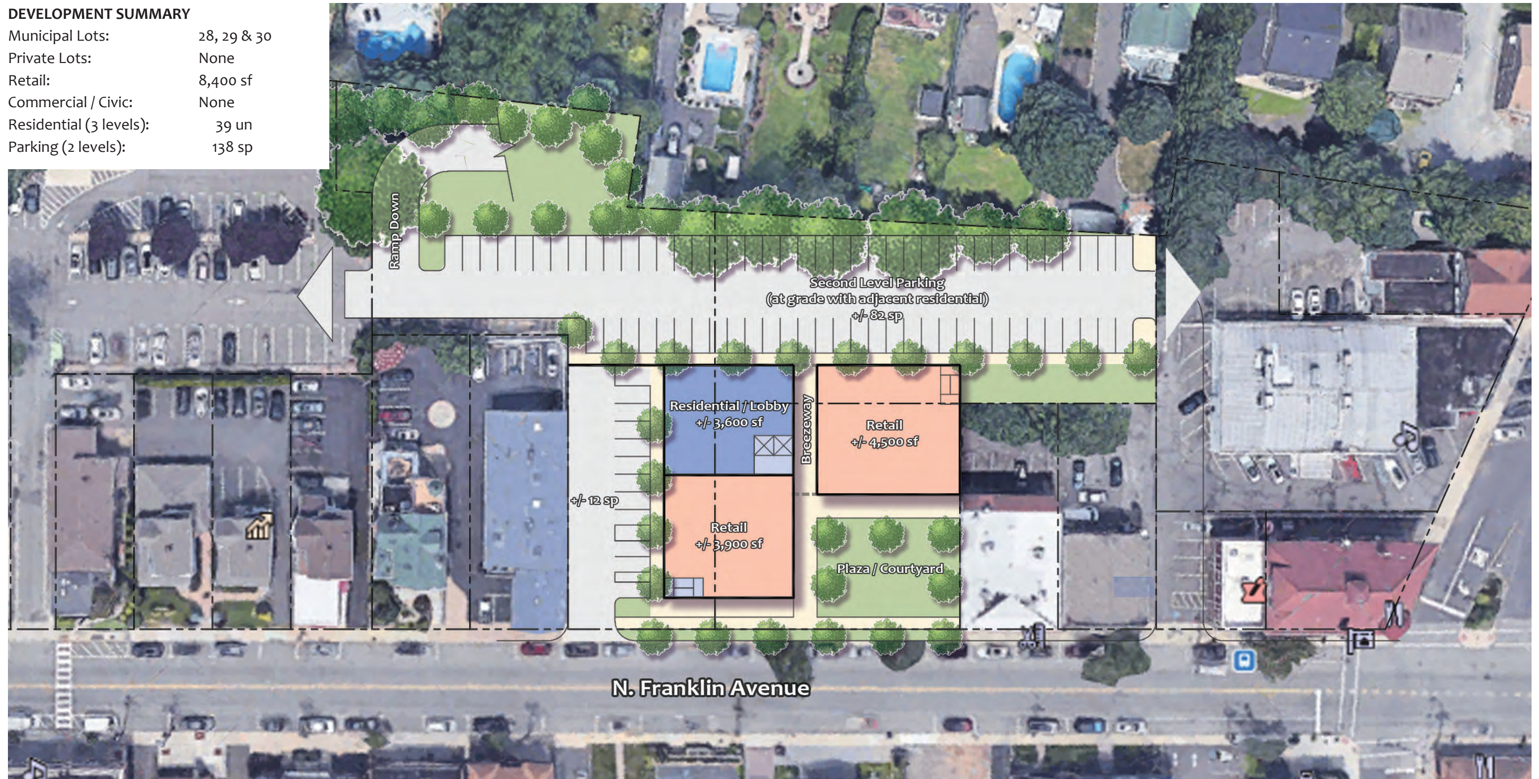
Franklin Avenue Retail Level with Second Level Parking at grade with rear properties