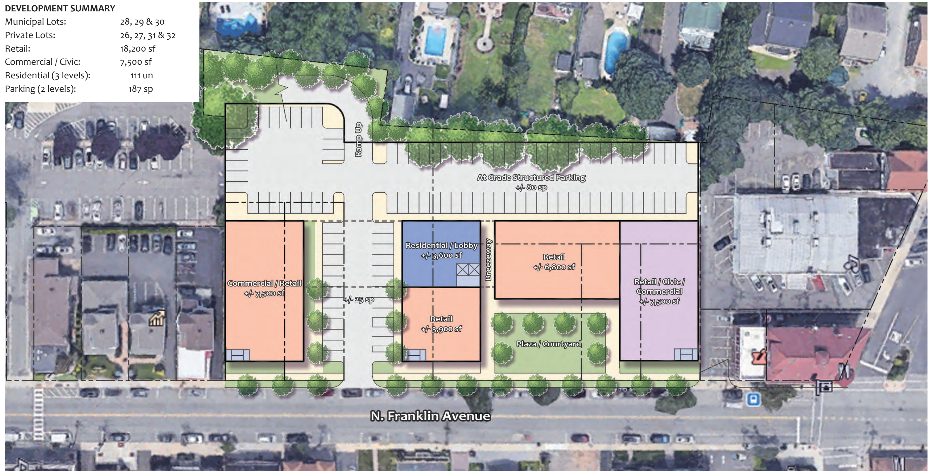
Franklin Avenue Retail Level with At Grade Parking