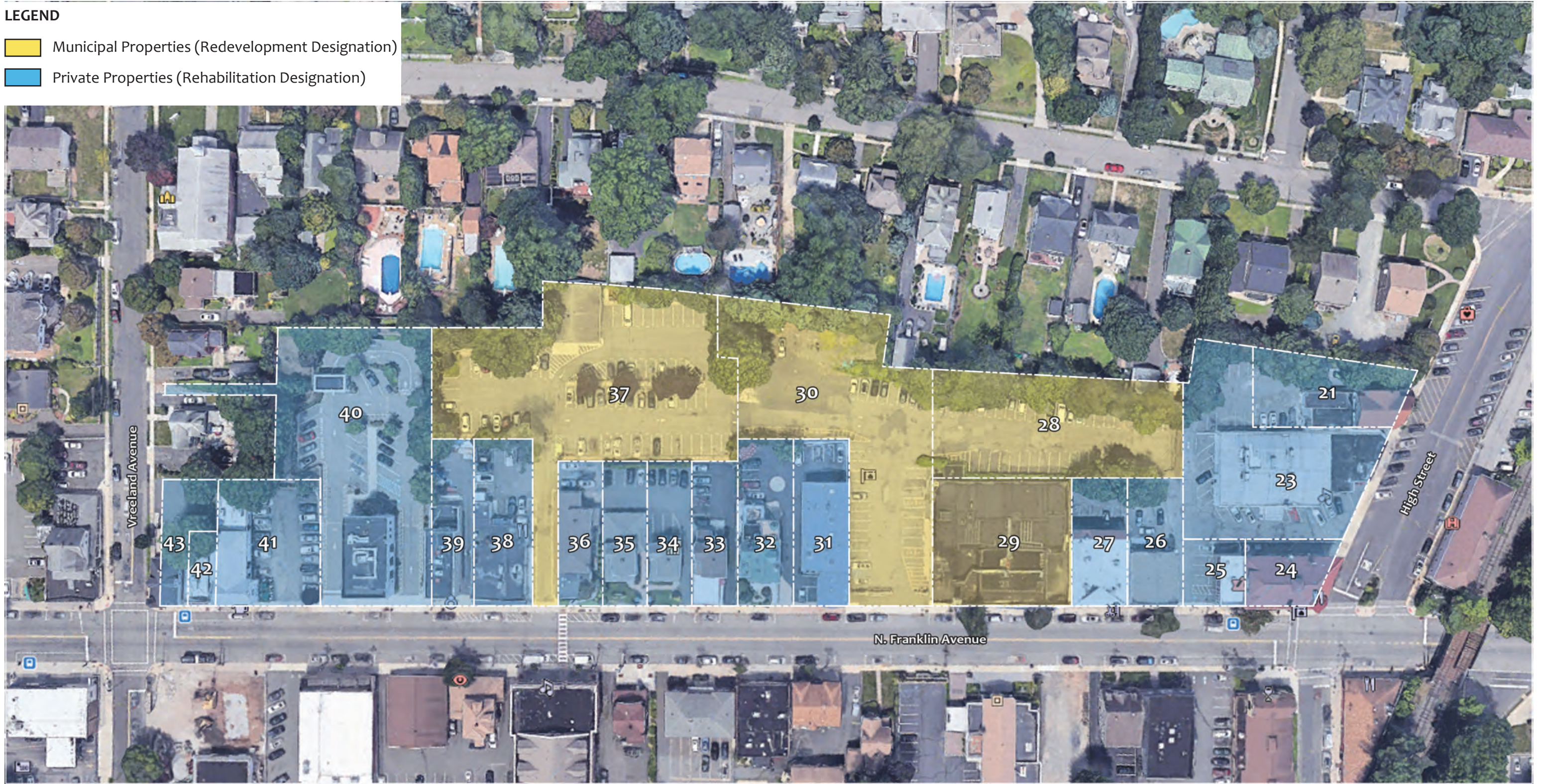
Rehabilitation and Redevelopment Area