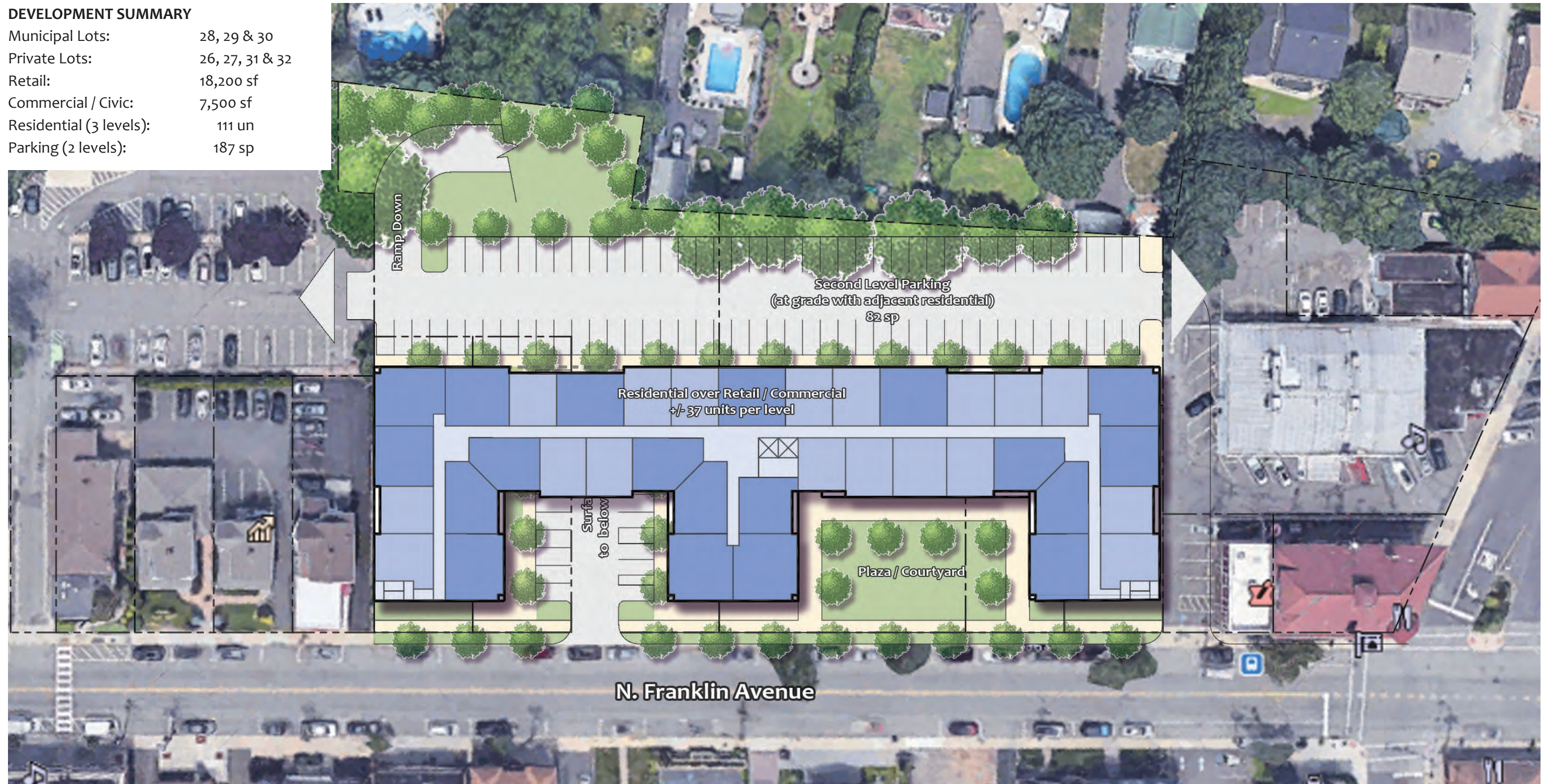
Residential Levels Typ. (3 levels)