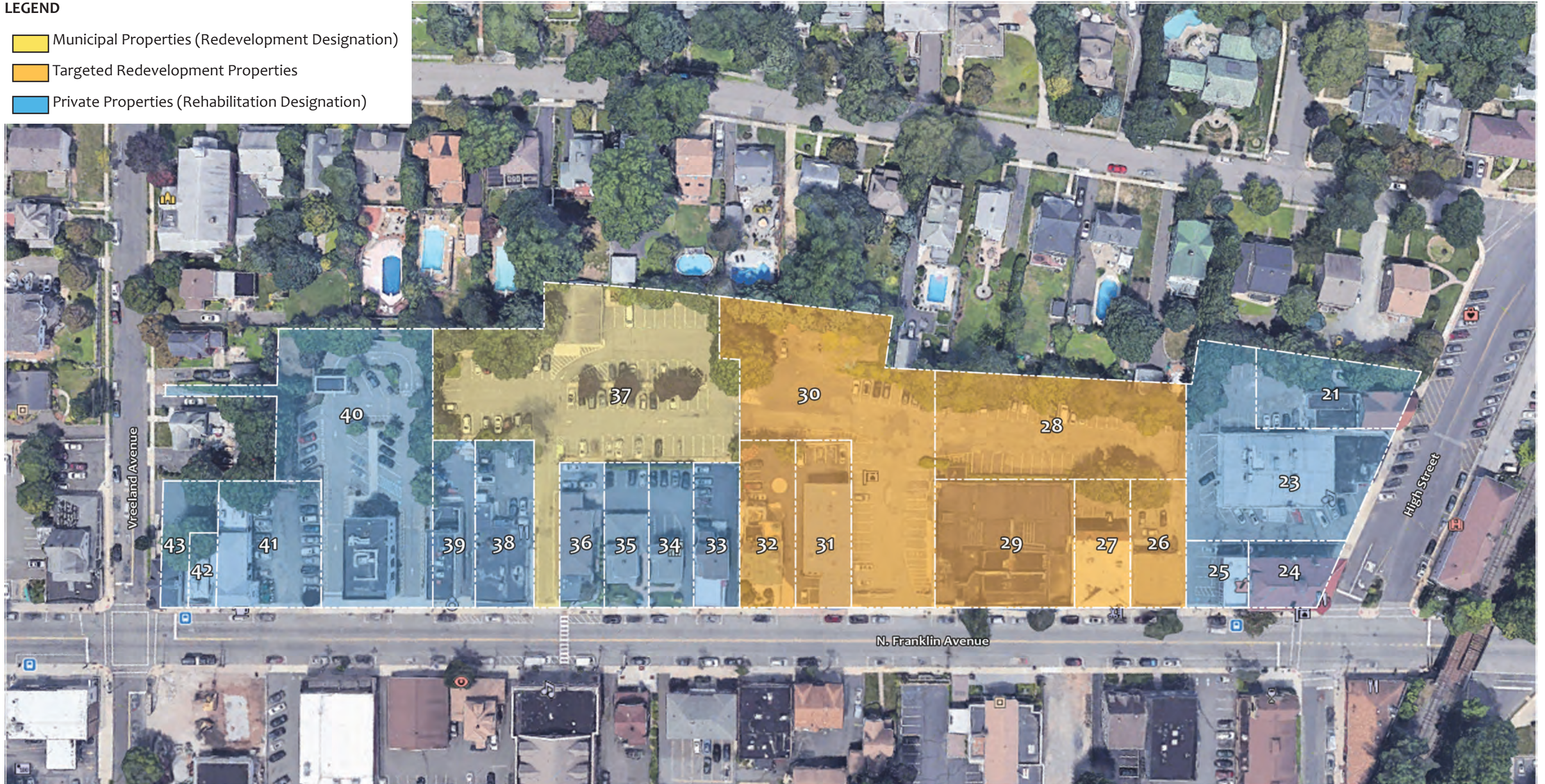
Redevelopment and Rehabilitation Area with RFEI Targeting Properties